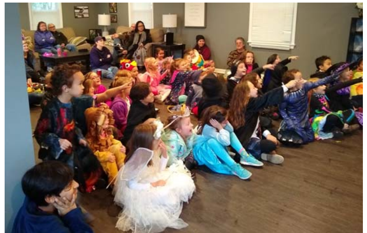
Youngsters and parents enjoy the Halloween magic show.

T he annual Halloween event was held inside the Kingston Chase clubhouse with eager children donned in costume but, unfortunately, the scheduled parade was nixed due to the rain. Creative and colorful costumes were the norm and there was plenty of room for the kids to spread out and enjoy the anticipated magic show.