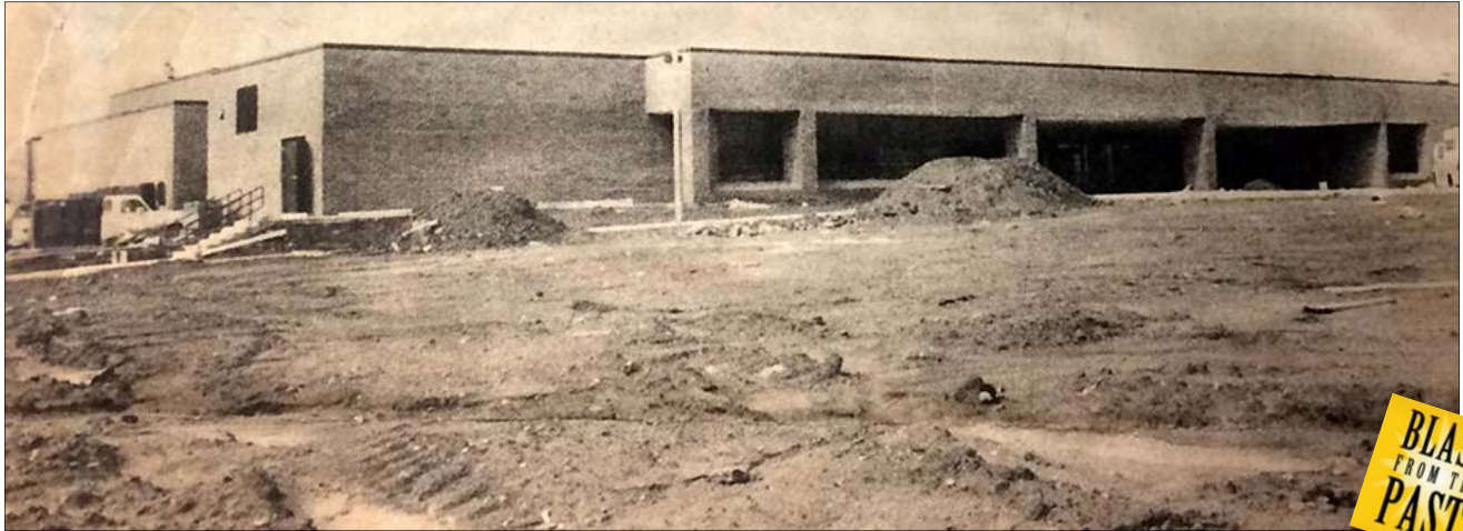
The Reston Times, August 23, 1979.

There will be an informational meeting on Wednesday, November 28, from 7:00-8:00 p.m. regarding planned renovations to Clearview Elementary School. The meeting will be held in the Clearview cafeteria. Clearview Elementary school was included in the 2017 School Bond Referendum for construction costs in the amount of $23,365,299. Anyone who is interested in getting an update on the latest information related to the renovation project is invited to attend.