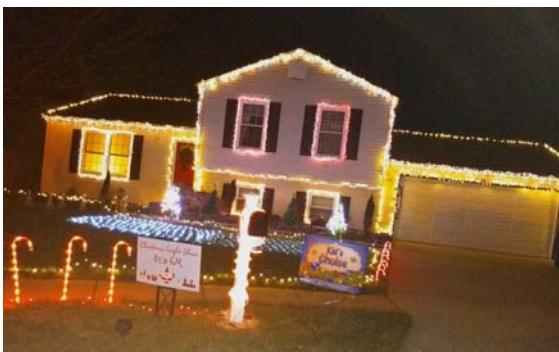
Kid's Choice 1604 Jubilation Court