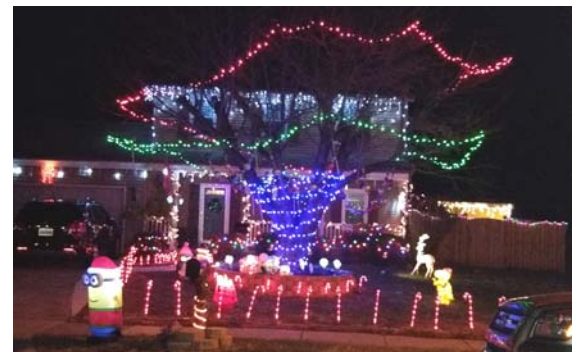
Most Creative 12706 Flagship Court