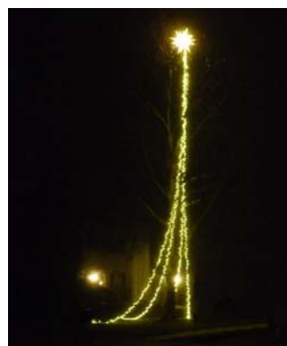
Traditional Beauty 1606 Sadlers Wells Drive