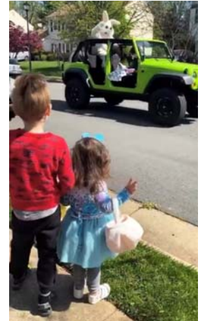
The Easter Bunny visits Kingston Chase