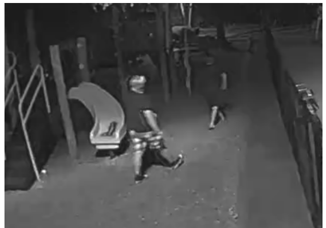
Individuals observed immediately after vandalism (painting) was spotted on the yellow slide at the Tot Lot.

Please report any information you may have about this vandalism, especially any recognition of the clothing and shoes worn. Please contact Pete Banks via e-mail at kchoa.watch@gmail.com or call 703-209-3004. Help in locating these perpetrators is greatly appreciated.