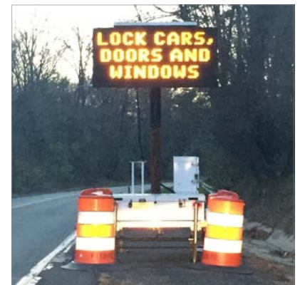
A sign on Hiddenbrook Drives reminds residents to lock up to prevent crime.