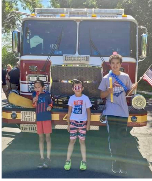
The Cuadro boys pose in front of a fire truck during the July 4 parade.