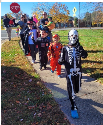
Kingston Chase residents march in the annual Halloween Parade before watching a magic show in October.