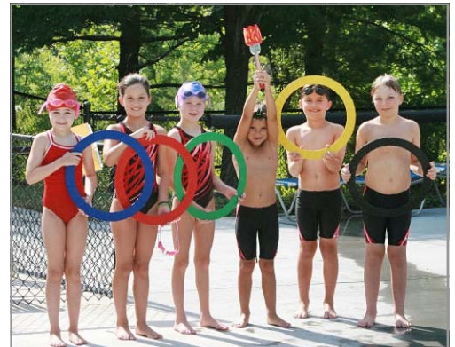
Herndon Olympics will be held July 12

Kingston Chase residents may swim at the Hiddenbrook Pool when our pool is closed for swim meets.