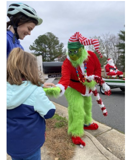
At left, Santa Claus poses with his many helpers during the annual drive-through in Kingston Chase. Above, a friendly Grinch shares treats and toys with young residents as Santa Claus visits Flagship Avenue.