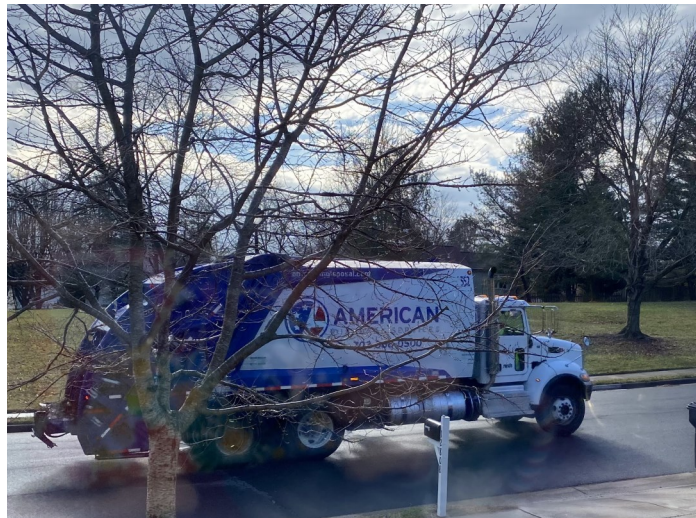
An American Disposal Services truck makes its weekly rounds through Kingston Chase on a recent Friday morning.

Haulin Trash had quickly become a popular KC provider, but the surprise closure left many residents scrambling to find services at a critical time of year. This re-sparked discussions