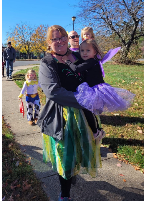
Playgroup families participate in the annual Kingston Chase Halloween Parade in 2022.

The HOA provides playgroup a budget for events, and the group has amassed a variety of craft supplies and musical instruments over the years.