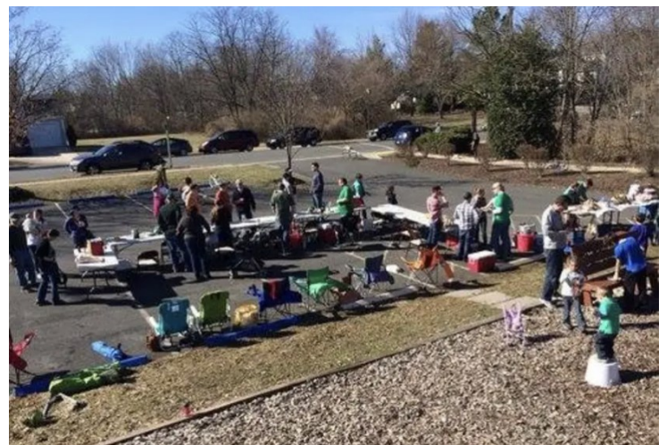
Kingston Chase residents gather for Brewfest, a Kingston Chase tradition that is back this year for the first time since the pandemic limited neighborhood events in 2020.