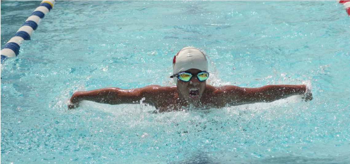
A Kingston Chase swimmer competes during a previous Herndon Olympics. The unique community swimming tradition will once again be held at the Kingston Chase pool in 2023.