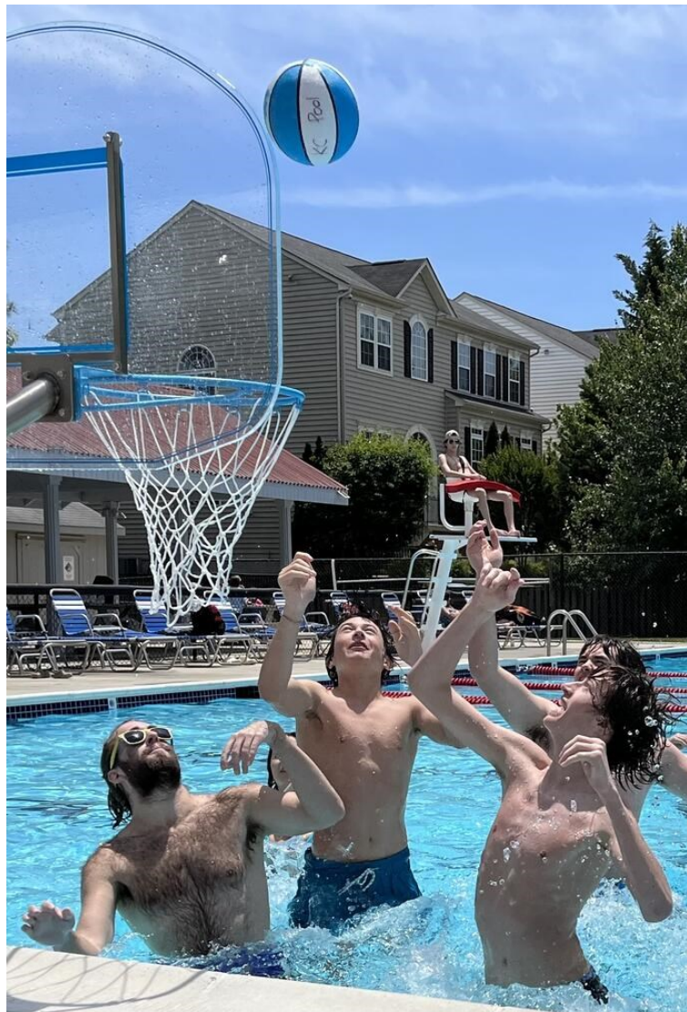
The Kingston Chase pool opened May 27 with all the traditional summer scenes: excited children, shivering parents and, of course, an intense game of 'splashketball'.

Finally, grownups, mark your calendars for July 29 for the annual Adult Pool Party . Come for the grown-up drinks, food, and the chance to chat with neighbors; then stay for the night swimming, sweet