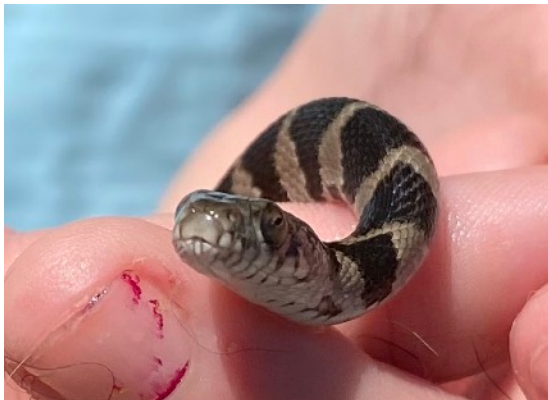
Many Kingston Chase canines — and one small reptile — enjoyed Dog Day at the Pool.