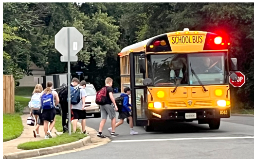
Herndon Middle School students board a bus near Fantasia Drive.

Parents should also remind their children to be extra vigilant and aware of traffic on their way to school or when boarding and exiting buses.